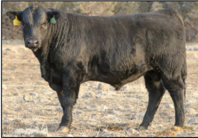
Lot 55 - BAR CK 1219Z 6175D