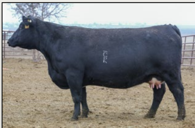
- BAR CK MS 9106 1003Z - 186 API, 91 TI; dam of Bar CK Snooze 4015B - one of the top sellers in our 2016 sale. Her progeny average 143 IMF ratio.