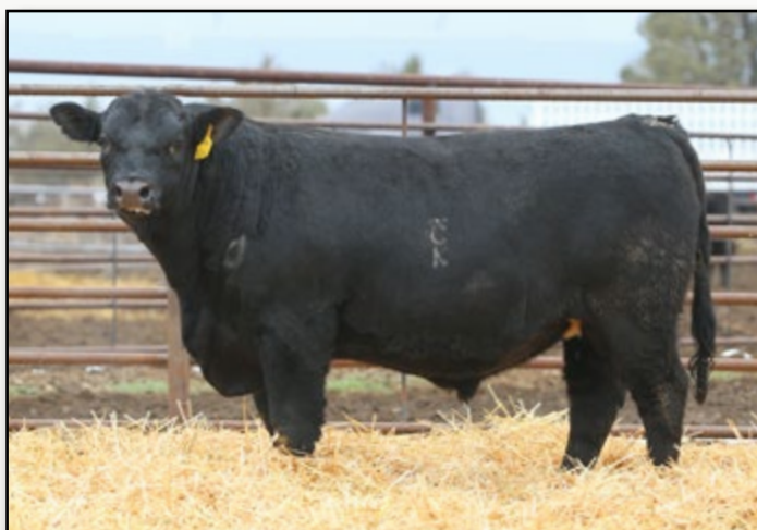
Bar CK Target 3016A sire of Lots 1, 2, 3, and 6