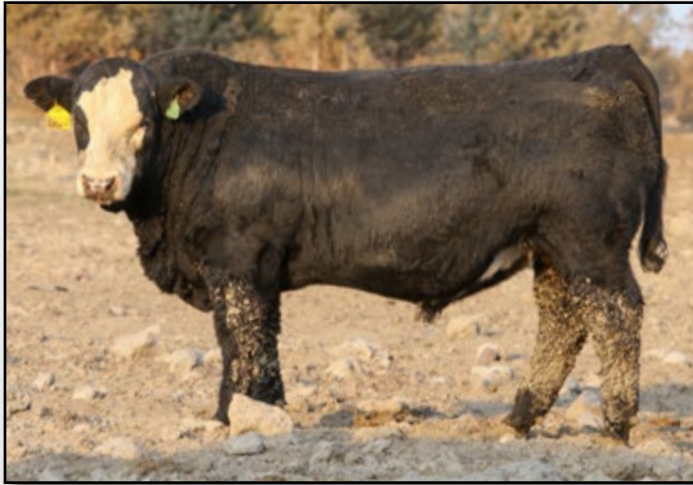
Lot 39 - BAR CK 4856B 6284D