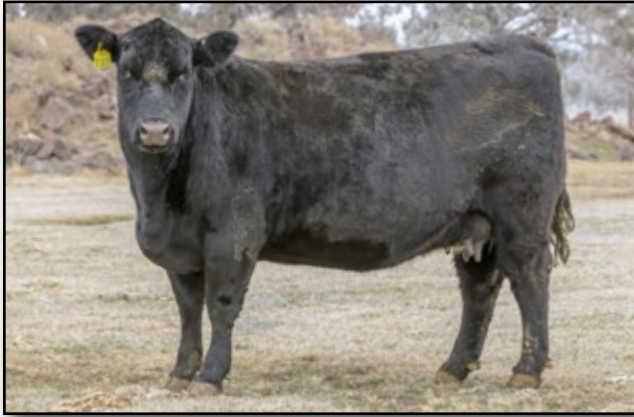
Lot 250 - BAR CK 3182A