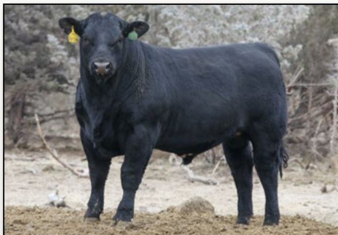
Lot 64 - BAR CK 1004Z 6043D