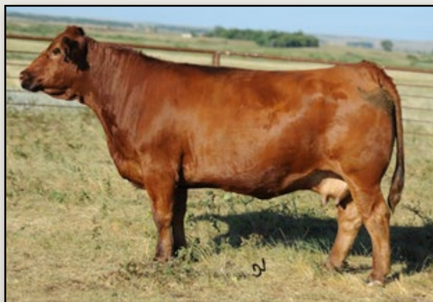
Hooks Mika 141M dam of Lots 10 & 11

Maternal brothers to Lots 10 and 11 - Xpection (Allied Genetics Resources) and Yukon (Origin) - are proven sires of productive females built to last. The mating of Hooks Mika 141M to Takeback adds a best 2% HerdBuilder, best 6% GridMaster and Top 2% Stayability and Marbling from the Red Angus side.