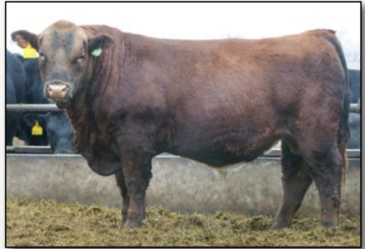
Lot 50 - BAR CK 4856B 6163D