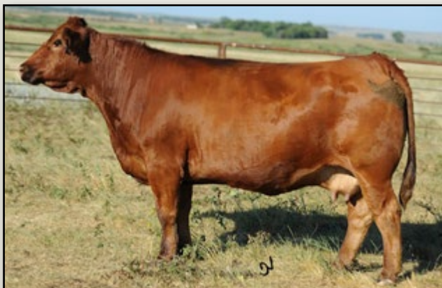
Hooks Mika 141M - Dam of Lot 203

● Bred AI on 12-5-17 to BAR CK 1006X 5251CD ● Pasture Exposed to BAR CK 1006X 5251CD from 12-15-17 until 3-15-18