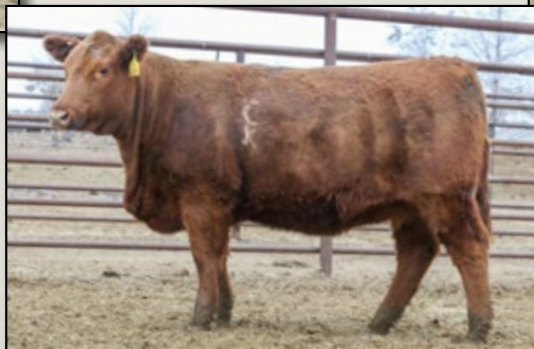
BAR CK MS 56B 6082D Hooks Beacon 56B x Resurrection 192 API, 92 TI Purebred; top 10% in 7 traits