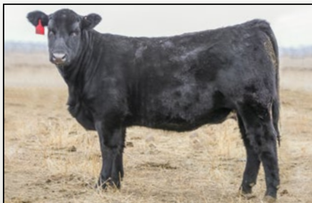
Lot 232 - BAR CK 6148D