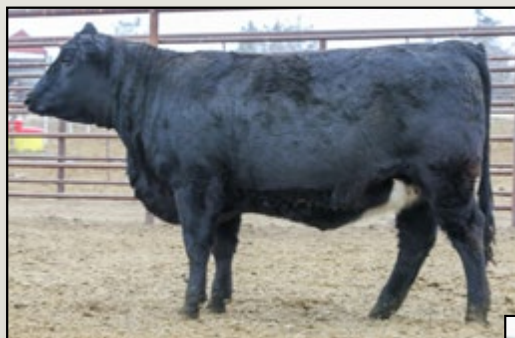
BAR CK MS 560 298Y 6091D 173 API, 85 TI sired By 5L Independence out of WS Northstar B180. Full brothers sell as lots 7-9 bulls and half sisters are the choice Lot 202 heifers.

OR - Pick her dam, WS Northstar B180 , the high profit Red Purebred in the database...and dam of an amazing set of Independence Bulls and Takeback Heifers.