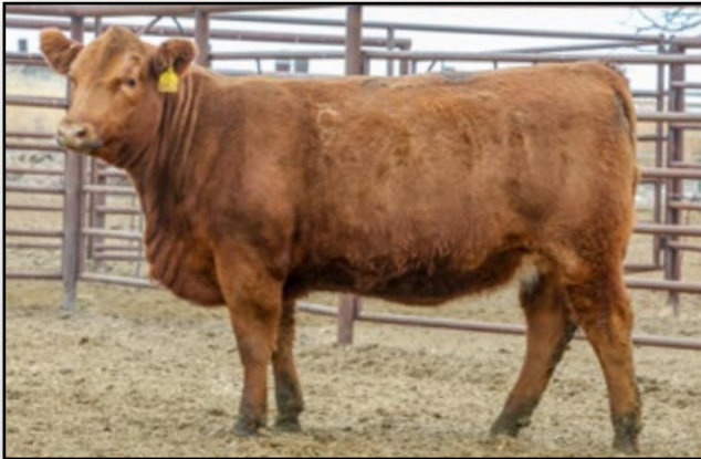
BAR CK MS 4856B 6136D