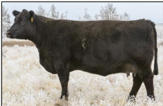
- BAR CK MS 6225 911Z - 203 API, 101 TI; this front-pasture female is the dam of Bar CK No Equal, and our top 2016 heifer.