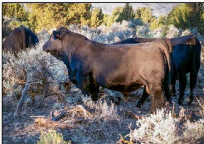
Lot 35 - BAR CK 3016A 6197D

Raised in our rocks & sagebrush to work in your rocks & sagebrush.