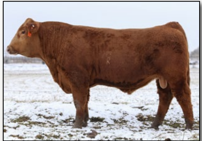
Reference Sire Bar CK Hunter 3006A