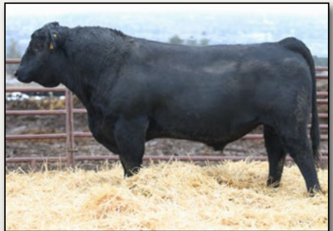
Reference Sire Bar CK Luck B1206Y