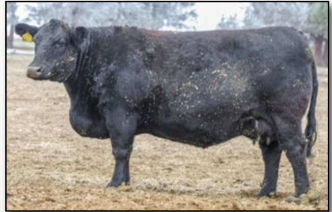
Lot 222 - BAR CK 1102Y