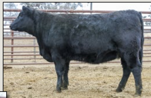
BAR CK MS 56B 6015D Hooks Beacon 56B x Tex Ambush 9106 173 API, 85 TI (3/4 SM / 1/4 AN)

OR - Pick her dam, WS Northstar B180 , the high profit Red Purebred in the database...and dam of an amazing set of Independence Bulls and Takeback Heifers.