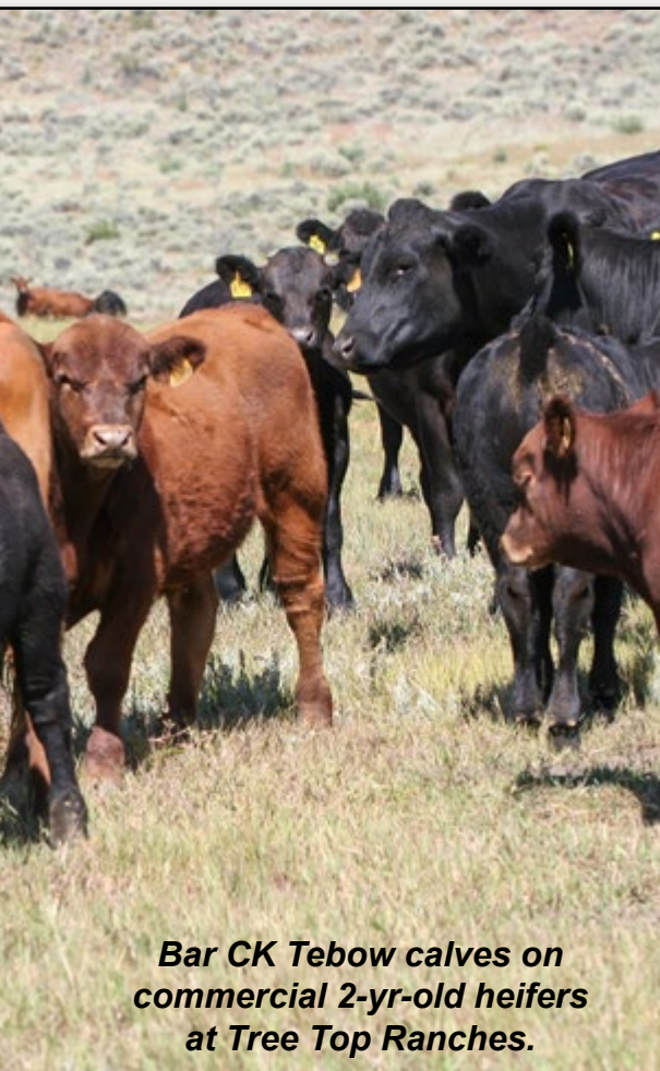
Bar CK Tebow calves on commercial 2-yr-old heifers at Tree Top Ranches.