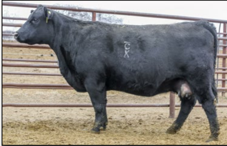
Lot 210 BAR CK 4161B