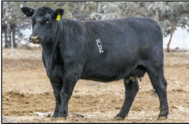
Lot 218 - BAR CK 3134A