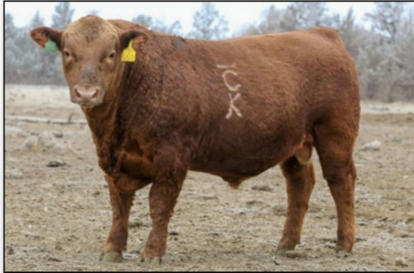
Lot 76 - BAR CK 4856B 6160D