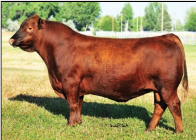
Reference Sire LSF TBJ TakeBack 4856B $100,000 Red Angus service sire to many of the bred females.