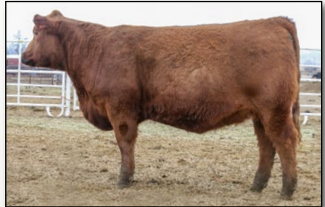
BAR CK MS 4856B 6075D