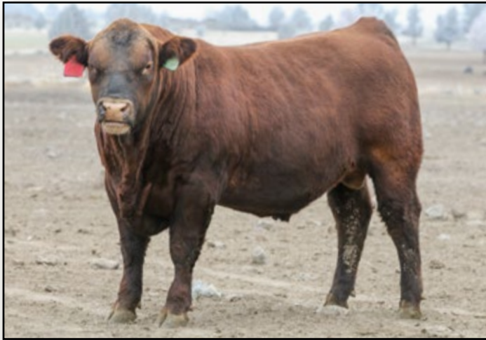
Lot 49 - BAR CK 4856B 603D