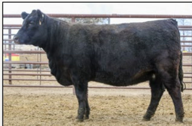
- BAR CK MS 3016A 6030D - 216 API, 103 TI; Target daughter out of 911Z (left). No other female like her in the ASA Database.