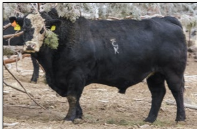
Bar CK Diego 3048A - Service Sire to many of the bred females. Best 1% API, Marbling, Top 4% Styability son of G A R Progress.