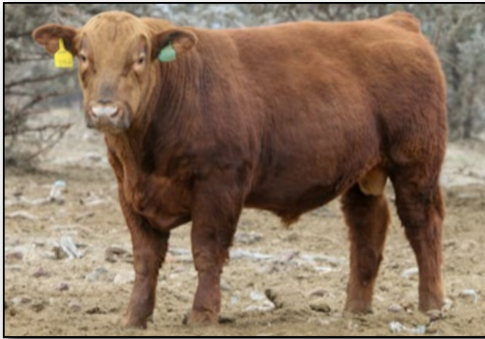
Lot 79 - BAR CK 3006A 6012D