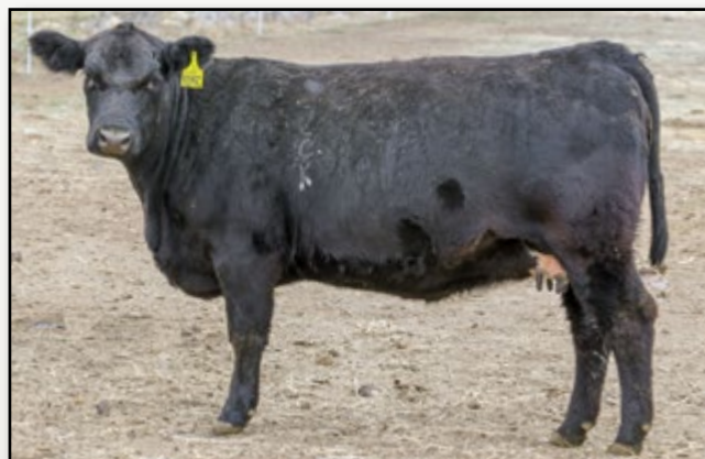
Lot 206 - BAR CK 5195C