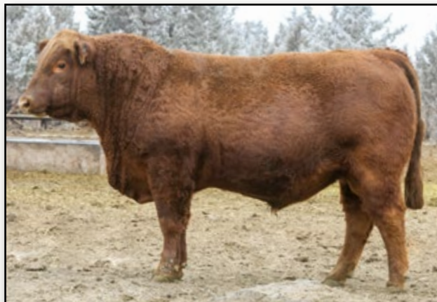
Lot 9 - Bar CK RedSpread 6119D