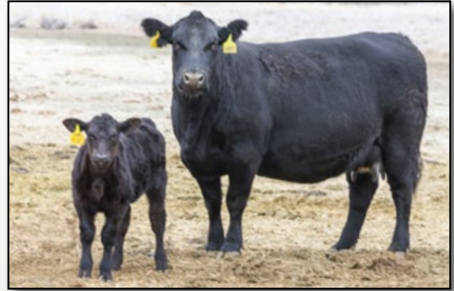
Lot 253 - BAR CK B1009Z with calf