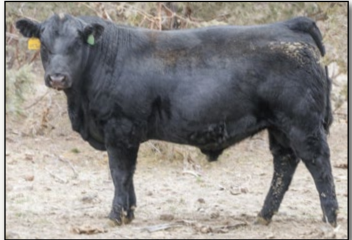
Lot 59 - BAR CK 1219Z 6274D