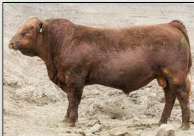
Lot 11 - Bar CK PayDirt 6127D