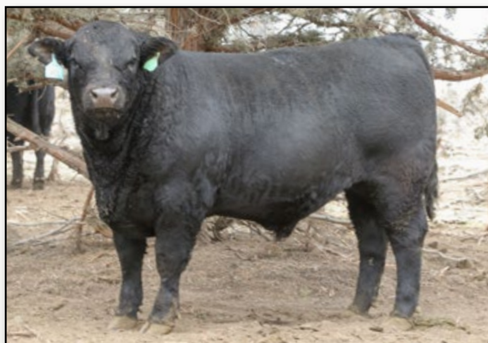
Lot 4 - Bar CK Bumper Crop 6096