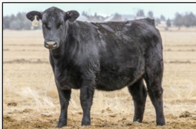
Lot 236 - BAR CK 6180D