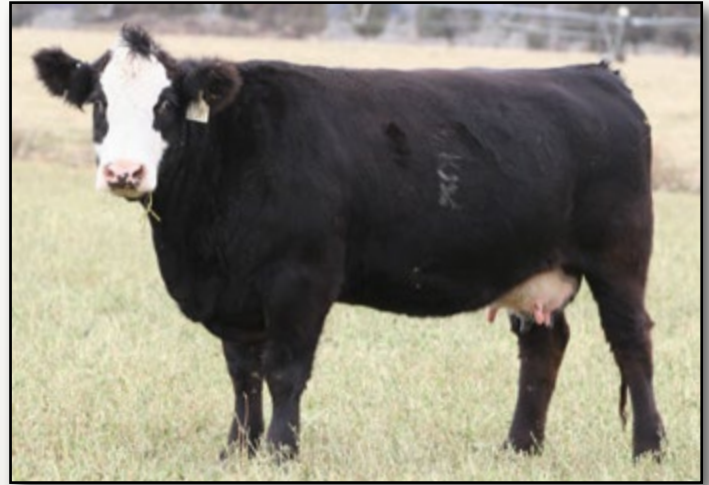
BAR CK MS VISION 520W Dam of Lot 39