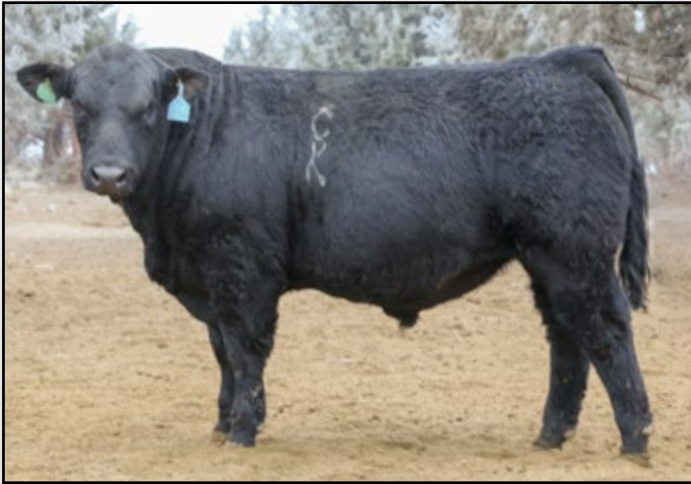
Lot 72 - BAR CK 3006A 6234D