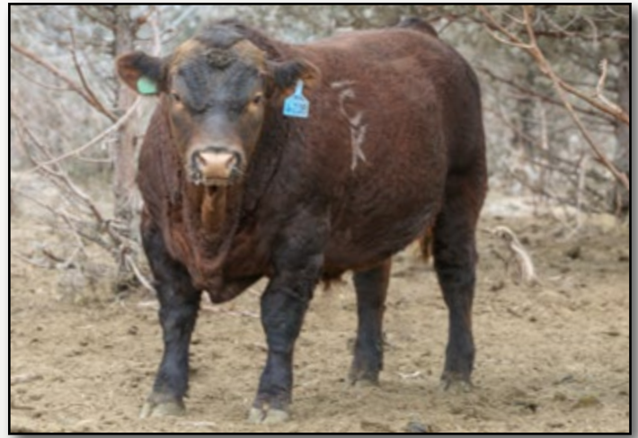
Lot 80 - BAR CK 4856B 6208D