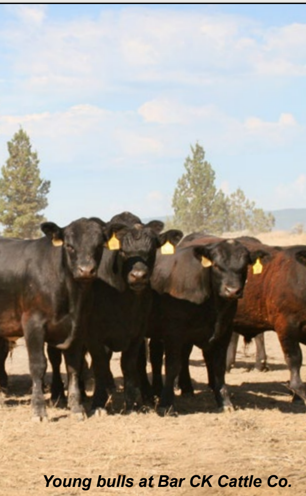
Young bulls at Bar CK Cattle Co.