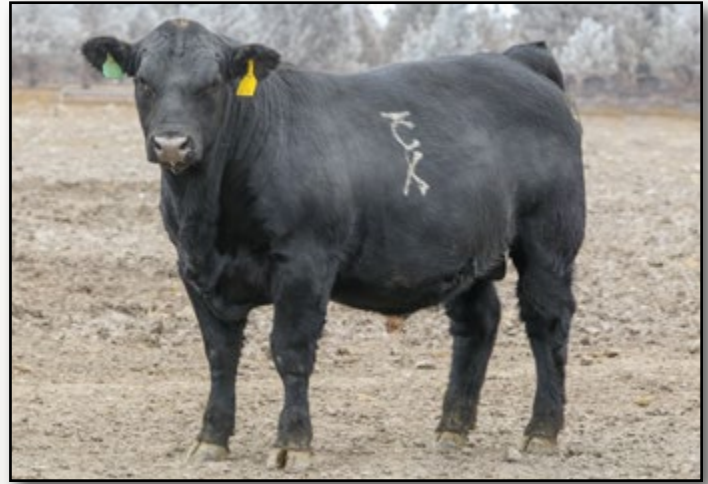
Lot 73 - BAR CK 1006X 616D