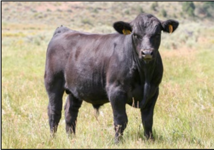
Bull calf out of one of our customer's 2-year old, sired by a Bar CK Calving Ease SimAngus