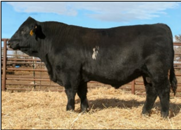
Reference Sire Bar CK Rogers 1004Z

(See page 5 for complete listing of our reference sires)