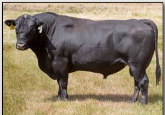
Reference Sire Bar CK Tebow 1006X The "Original 200 API" SimAngus