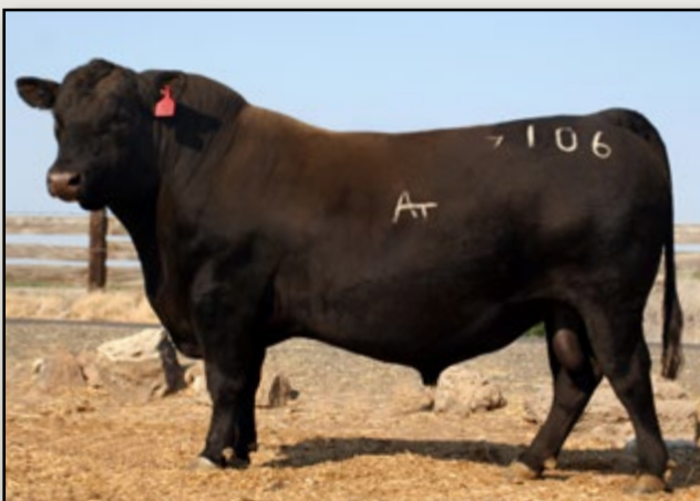
REFERENCE SIRE: TEX Ambush 9106