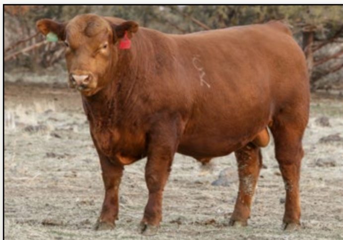
Lot 48 - BAR CK 0029X 6083D