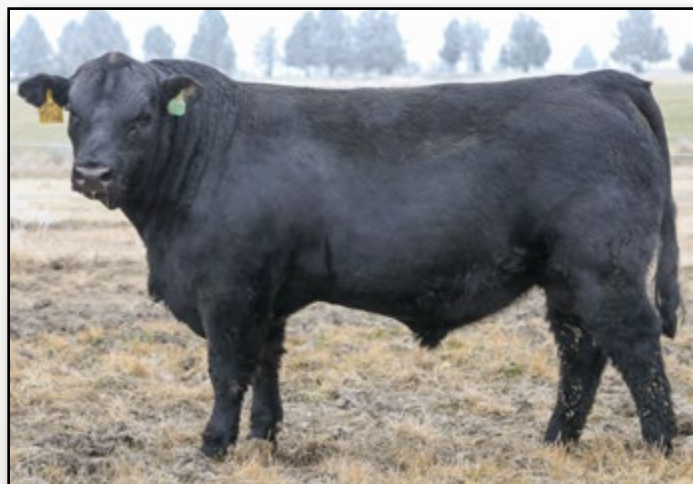
Lot 67 - BAR CK 4015B 6143D