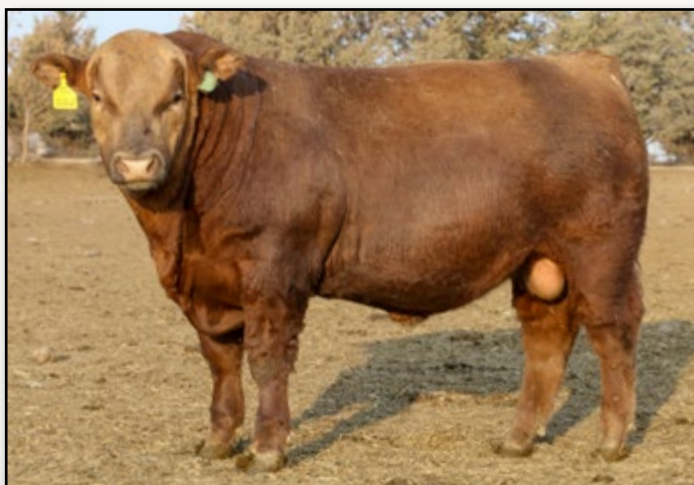
Lot 46 - BAR CK 4856B 6102D