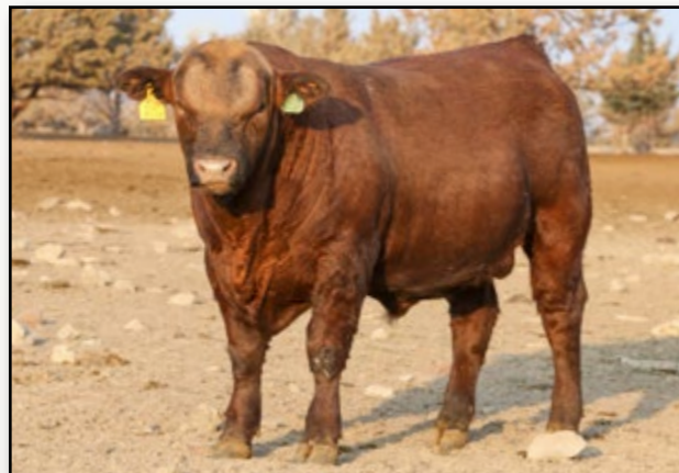
Lot 10 - Bar CK PayBack 6118D