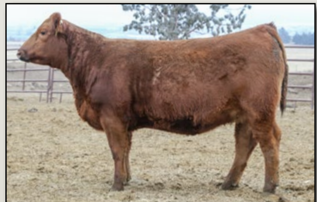
Lot 203 - BAR CK Mika 6132D 37